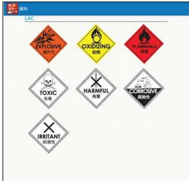
Chemical Safety Database Simulator