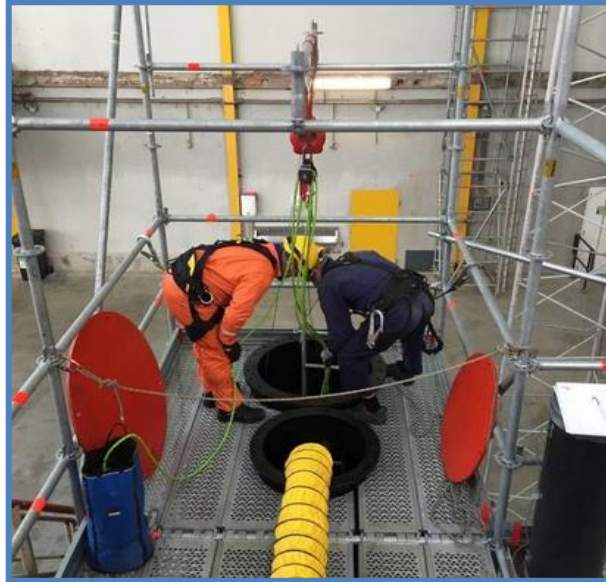
Rope Rescue Operations

Practical sessions will be organized for delegates to practice the theory learnt. Delegates will be provided with an opportunity to carryout rope rescue operations using Haward equipment. Theory learned in the class will be applied using the rope rescue methods and equipment.