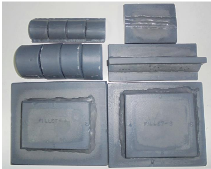
American Welding Society (AWS) Tool Kit and Structural Weld Replica Kit