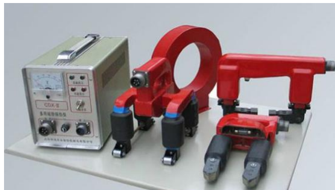
Magnetic Particle Testing (MT) Equipment

Practical sessions will be organized during the course for delegates to practice the theory learnt. Delegates will carryout NDT inspection using our “Magnetic Particle Testing (MT) Equipment” and our specifically designed flawed specimen test components.